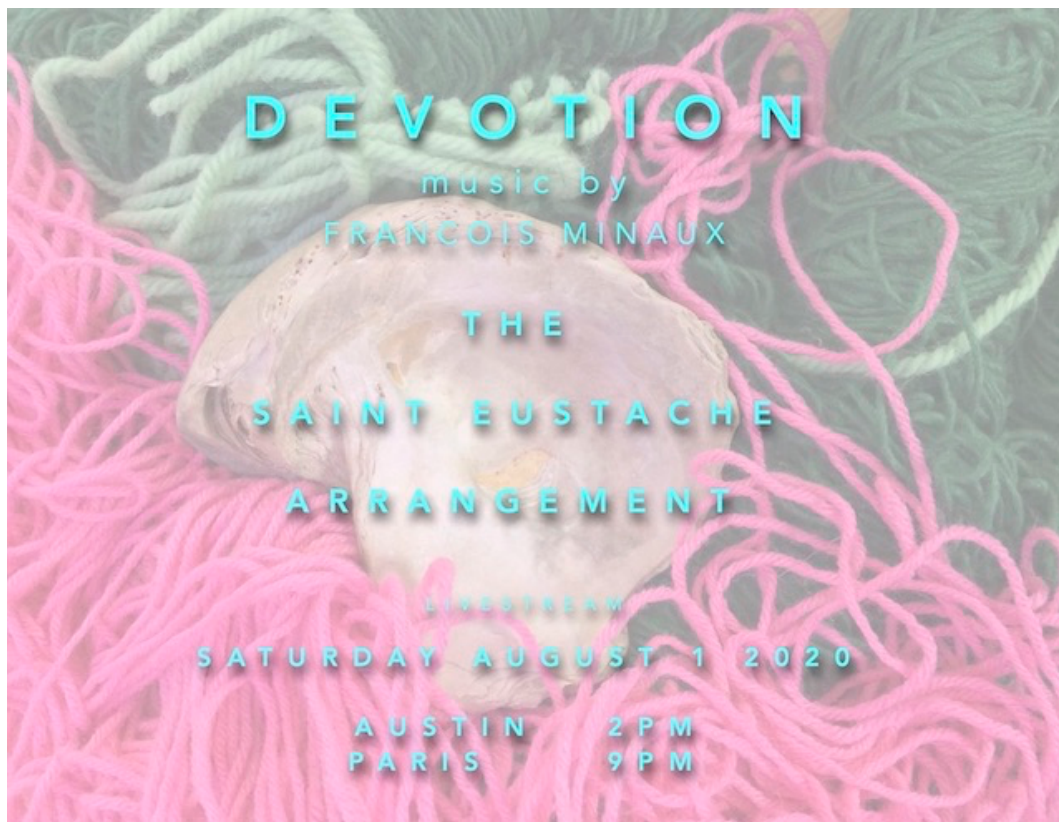
Facebook page poster for the Saint Eustache Arrangement livestreamed show on AUGUST 1 2020