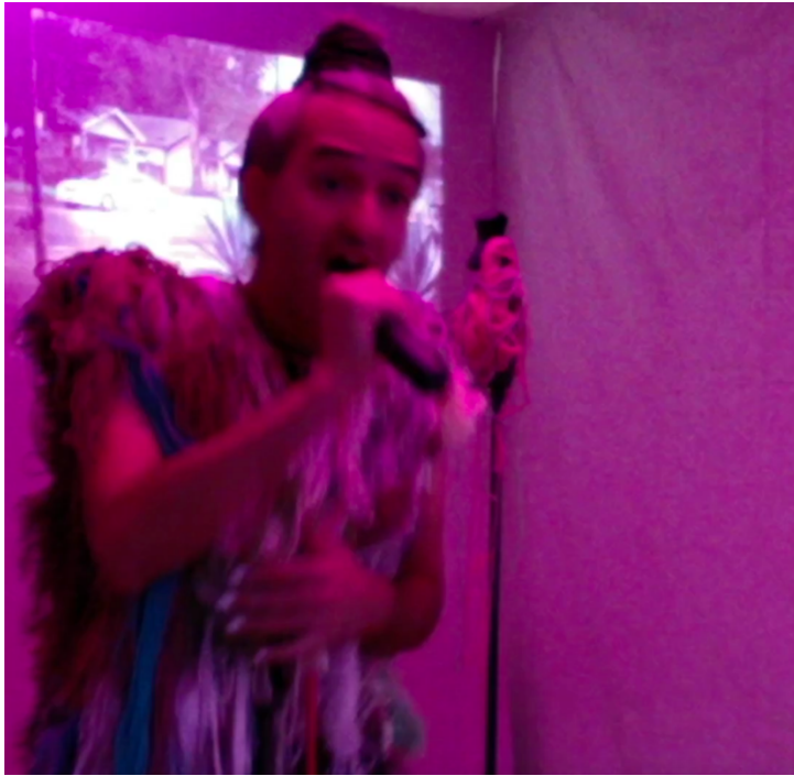
Devotion - video still from the VORTEX virtual programming livestreamed show on MAY 14 2020 on the VORTEX social medias channels.