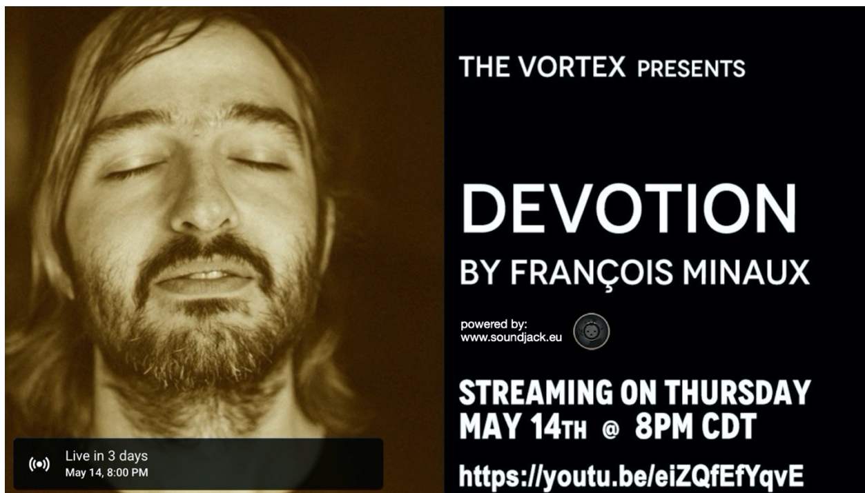
Youtube ad for the VORTEX virtual programming livestreaming show on MAY 14 2020