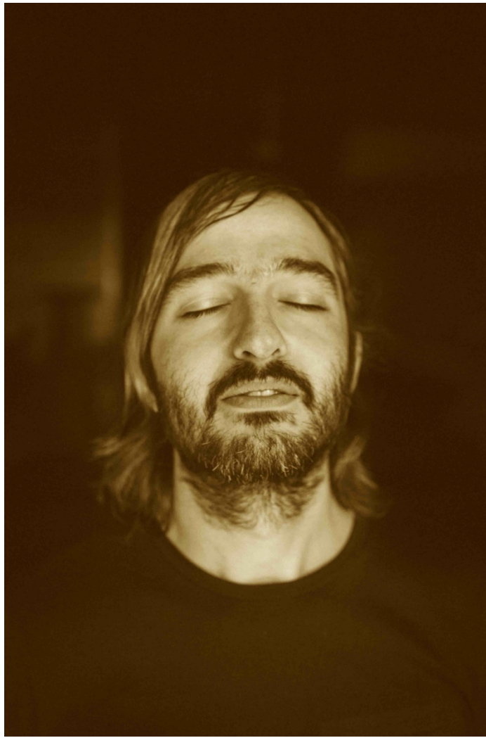
Album cover art