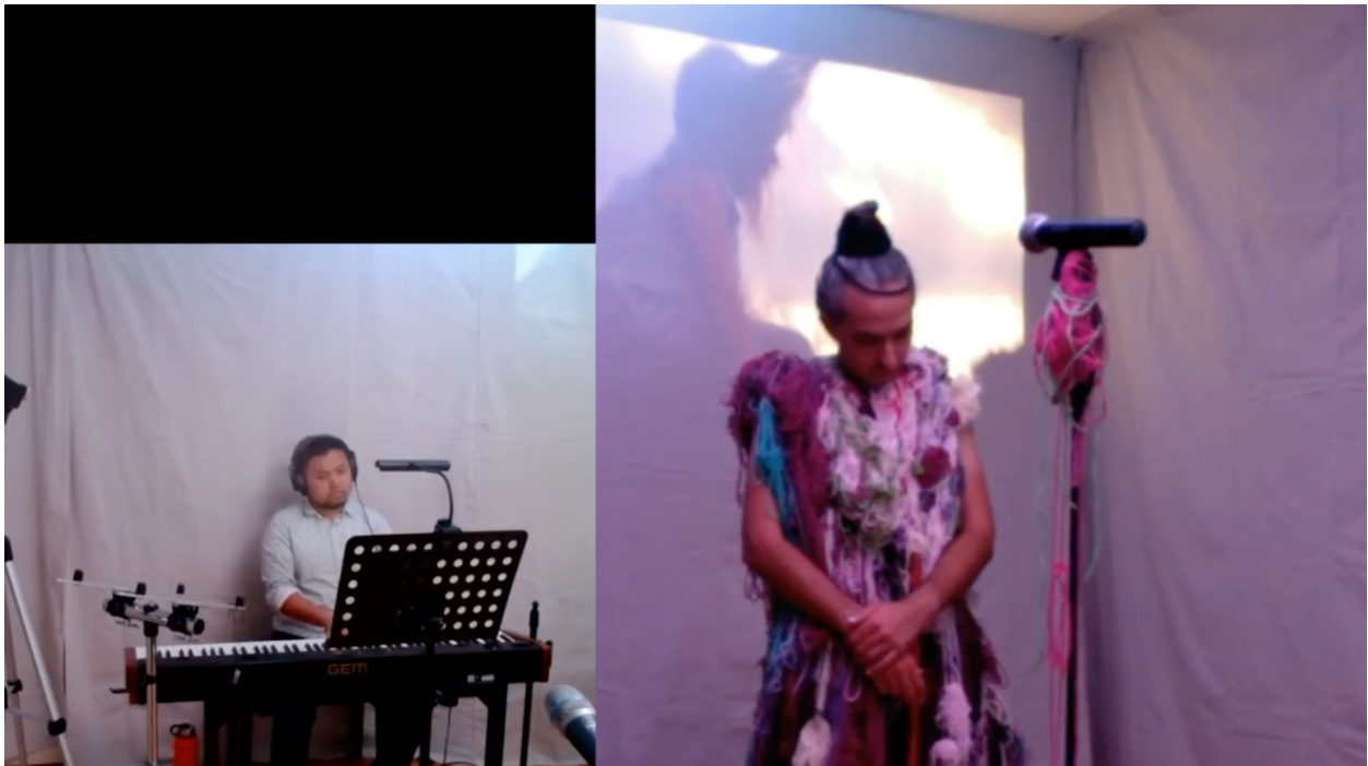
Devotion - video still from the VORTEX virtual programming livestreamed show on MAY 14 2020 on the VORTEX social medias channels.